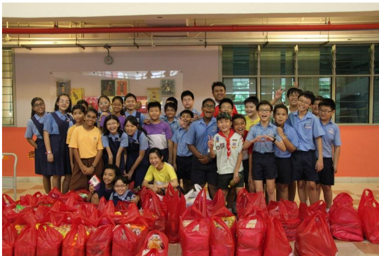
'Food from the Heart' donation drive held in school

To create opportunities for students to reach out to the community and to integrate sustainable school projects into the school curriculum, I initiated the 'Food from the Heart' food donation drive in 2007. In 2008, this project was led by the Scouts and Infocomm Club members, who produced a video clip to rally the support of the school community. Eight years after its launch, this meaningful project is still carried out annually by the uniformed groups and student leaders. Every year, teachers also participate in this project by going to the food distribution centre to distribute the donated food to the residents!