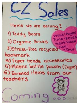
Advertisement posters put up around the school for staff and schoolmates