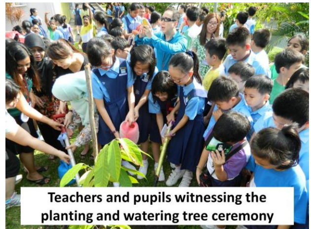
Teachers and pupils witnessing the planting and watering tree ceremony

Colourful Corn Harvesting with our school principal during Green Wave Day! 😊