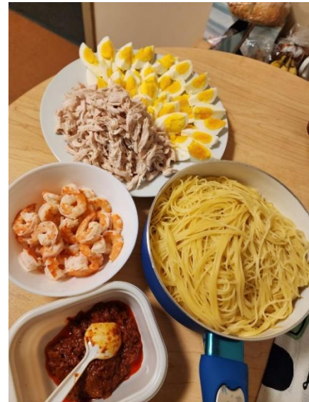
My version of Laksa, improvising with Angel Hair spaghetti instead of Bee Hoon

It was amazing to see the coming together of the 21 of us at IUP as we celebrated one another's birthdays and had our weekly Movie Nights. Such bonds, I believe, would lead to a lifetime of partnerships as we continue to explore ways to advocate the kind of learning experiences we want to create for our learners.