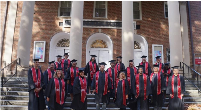
21 Fulbrighters from 14 different countries (Botswana, Brazil, Finland, Greece, India, Indonesia, Israel, Mexico, Morocco, New Zealand, Philippines, Senegal, Singapore and Uganda)

It has been both a privilege and a superbly humbling experience to have been a participant on the 2022 Fulbright Distinguished Award for International Teachers at Indiana University of Pennsylvania (IUP). Working alongside and learning from a team of international colleagues from 14 other countries had broadened my perspective to the many possibilities the educational fraternity around the world can work towards. Together, with a common heartbeat, we can overcome challenges and be that strong advocate for our students. This is an indelible mark that the four-and-a-half months of