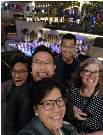
With fellow Fulbrighters in New York City

States, we went on different cultural excursions. Apart from appreciating the different wonders on these journeys, we were given an opportunity to sit next to our colleagues from the different countries to forge new relationships. In our conversations, we built relationships at a personal level, sharing