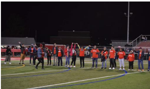
Fulbrighters at a Indiana Football Match

We were also introduced to the world of sports: a favourite American pastime and one that bonded people together. I have never been much into sports, but being in the stadium with the locals, I could feel the excitement