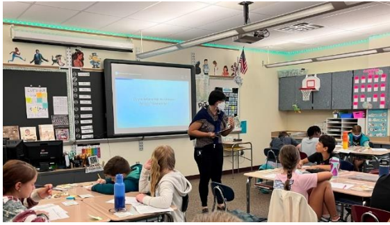
Co-teaching with my partner teacher in a Grade 5 English Language Arts Lesson

Weekly field visits to schools gave me the opportunity to observe and co-teach in American urban and rural settings. This gave me a fabulous insight into the day-to-day education enactment. The rich discussions I had with my partner teachers and opportunity