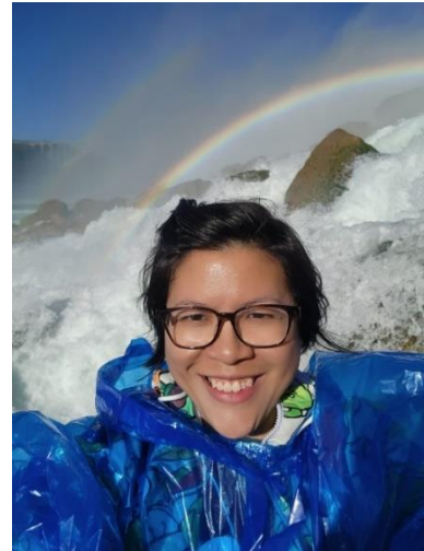
At Niagara Falls

One of the most impactful excursions was the visit to the Niagara Falls. The majestic view and roaring waters reminded me of the boundless possibilities as educators. I was not surprised to learn that the City of Niagara was the birthplace of hydroelectric power, supplying homes and businesses with electricity. It was an awe-inspiring moment standing directly under the Falls when I visited the Cave of the Winds, located behind the Bridal Veil Falls.