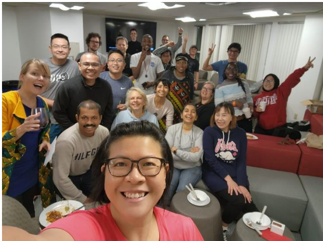
One of the nights where we celebrated as a Whanau and including other International Students in our cookouts

Having to live and to work with colleagues from 20 different other countries proved to be the most eye-opening experience for me. Apart from the casual conversations taking us late into the night, we also had “Whanau”, family time which was shared by our colleagues from New Zealand. It was the coming together of different cultures, cooking for one another and learning about different cultures and practices that made it easy for all of us to connect with one another.