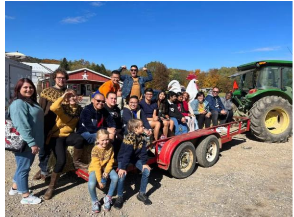
Visit to Yarnick's Farm to pick out our pumpkins

the Fulbrighters were brought to Yarnick's Farm to experience the Corn Maze and to pick out pumpkins from a larger pumpkin patch! If not for this opportunity on the Fulbright DAI programme, I probably would never had the chance to experience this season as it would be term time.