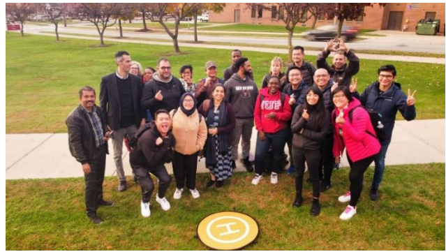
Exploring the use of drones in one of our Technology Seminars

Throughout our exchange programme, we were immersed in professional development learning i.e., Fulbright Seminar, Technology Workshop and attending Audit courses. Through these platforms, we learnt about the educational contexts from our peers all