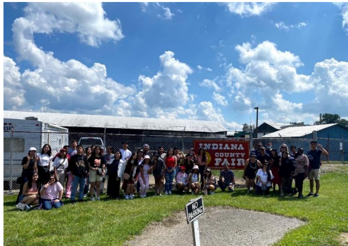
Visit to Indiana County Fair

“All work and no play make Jack a dull boy!” Whilst we worked hard, we also played equally hard! To assimilate ourselves into the way of life and culture, and expand our