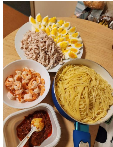
My version of Laksa, improvising with Angel Hair spaghetti instead of Bee Hoon

It was amazing to see the coming together of the 21 of us at IUP as we celebrated one another's birthdays and had our weekly Movie Nights. Such bonds, I believe, would lead to a lifetime of partnerships as we continue to explore ways to advocate the kind of learning experiences we want to create for our learners.