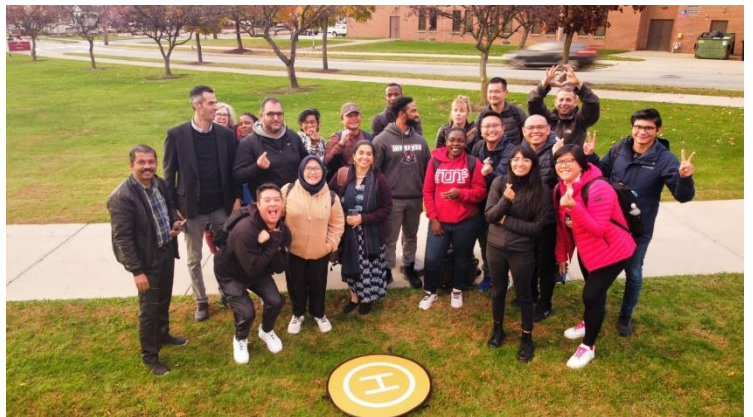
Exploring the use of drones in one of our Technology Seminars

over the world. We had deep and insightful conversations that addressed the different educational challenges we faced. The varied technological tools we were exposed to