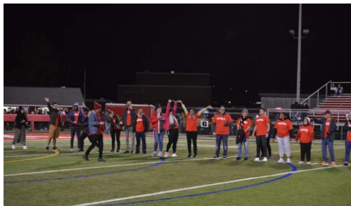
Fulbrighters at a Indiana Football Match

We were also introduced to the world of sports: a favourite American pastime and one that bonded people together. I have never been much into sports, but being in the stadium with the locals, I could feel the excitement