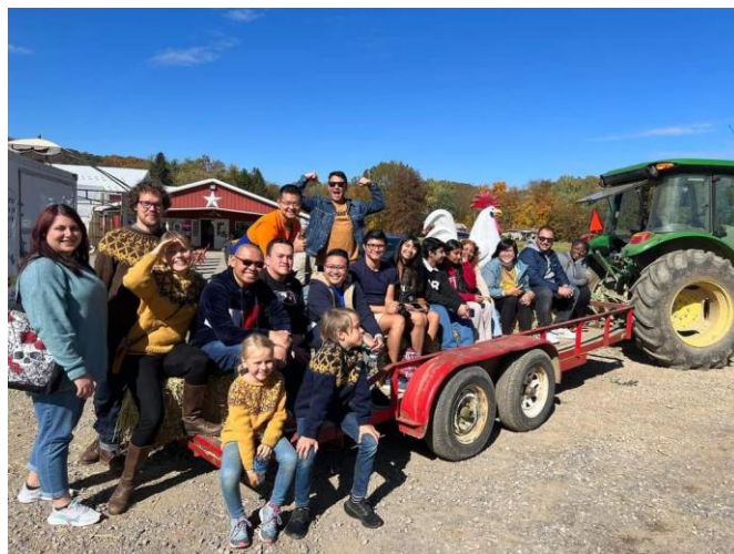
Visit to Yarnick's Farm to pick out our pumpkins

My first experience of plucking a pumpkin from a patch was at the 100-acre home of my