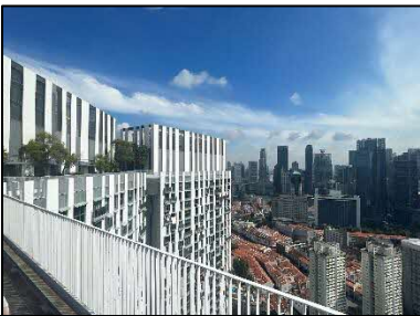
Pinnacles at Duxton's Rooftop Skybridge

My first host school, Oasis Primary School, practiced Place-Based Learning (PBE), a pedagogical approach that leverages students' physical space beyond the walls of their school to create exploratory and immersive learning experiences and activities. This is something I intend to bring back to my school in the United States because I saw how rich the learning journeys and service projects were for students immersed in their local heritage, culture, landscapes, and environment. I want my students to have community pride in the world around them, whether it is celebrating unsung heroes in their community or becoming proactive environmental stewards. I also believe PBE will establish a stronger community-school relationship where students will be able to act on issues important to their local areas and deepen their knowledge of cultural histories.