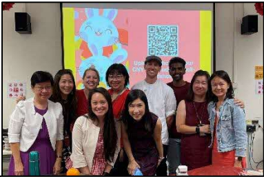
Chinese New Year Celebration with AST