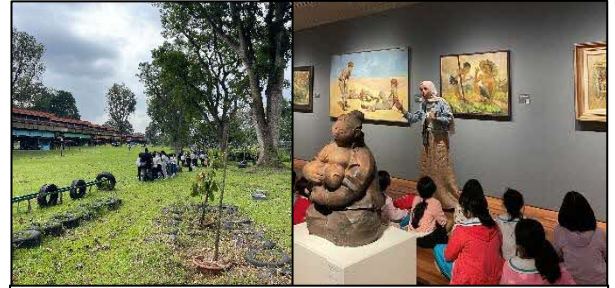
CCE Camp and Learning Journey with Oasis Primary School

Students in Singapore are just as curious, friendly, and hardworking as my students back home. Younger primary students invited me to their hands-on learning activities, such as playing ukuleles and reading stories during library hour. I also enjoyed visiting my older primary students at Character and Citizenship Education Camp in Jalan Bahtera and accompanying them to their art learning journey at the National Gallery Singapore.