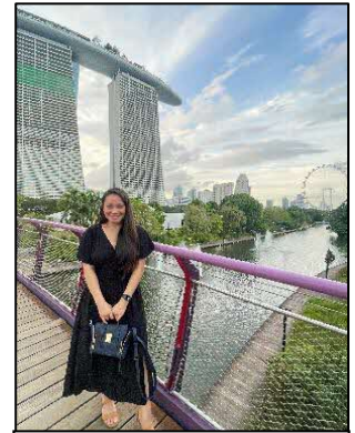
Marina Bay Sands

My first few weeks in Singapore with the Academy of Singapore Teachers (AST) were incredibly memorable because I was able to experience Singapore’s natural rhythm and culture through the eyes of locals. I learned about the importance of embedded community spaces for residents of all ages, such as the park connector network (PCN) and purposeful HDB playgrounds and void decks. I bonded with friends in hawker centers and wet markets over new foods (i.e., hokkien prawn mee, rojak, black carrot cake, and durian shaved ice). I explored the visual arts around me, such as the murals in Chinatown and the artifacts in the National Museum of Singapore. I visited the Istana with its lush gardens and incredible architecture. All these experiences really grounded me and empowered me to design culturally relevant lessons for students at my host