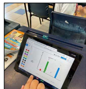
Students using Virtual Manipulatives (Unification Cubes to Construct Bar Graphs)